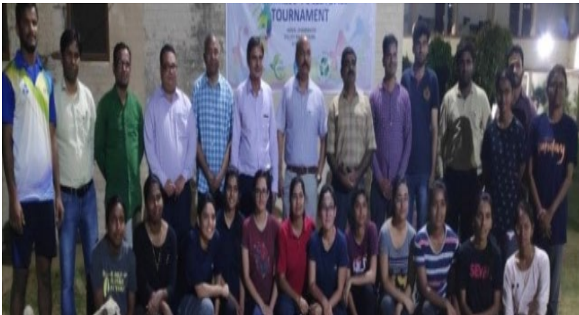
Joint Director Academics with other officials and volleyball winner team players on 17/4/2019