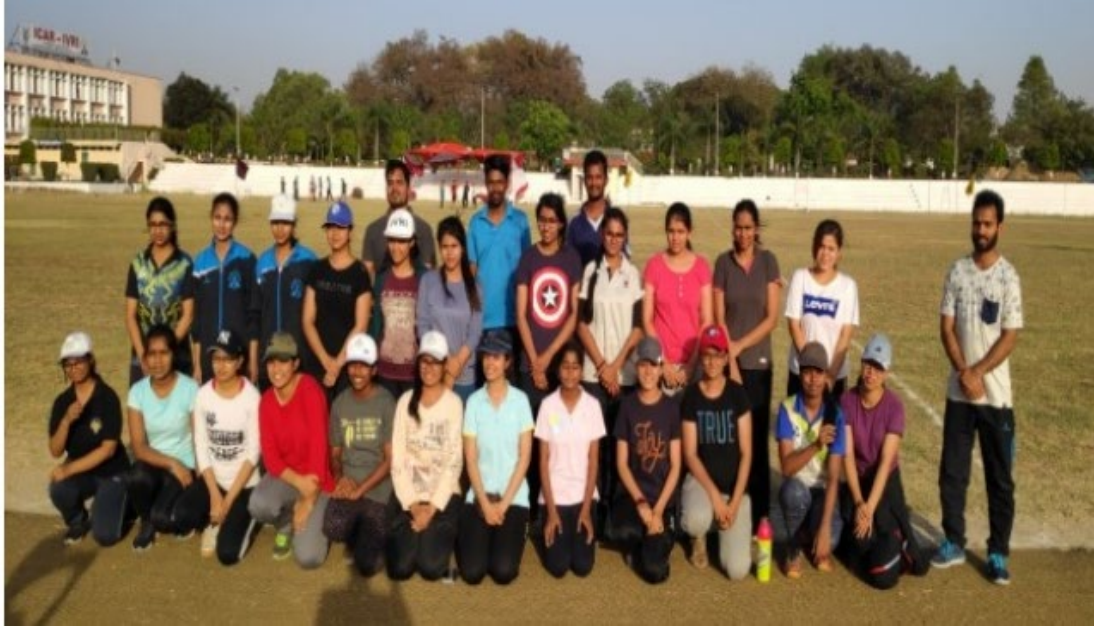
Girls Cricket team players before match on 15/4/2019