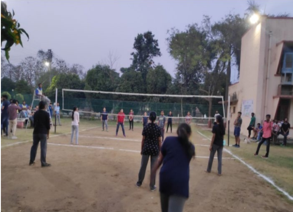
Final volleyball match (Girls) on 16/04/2019