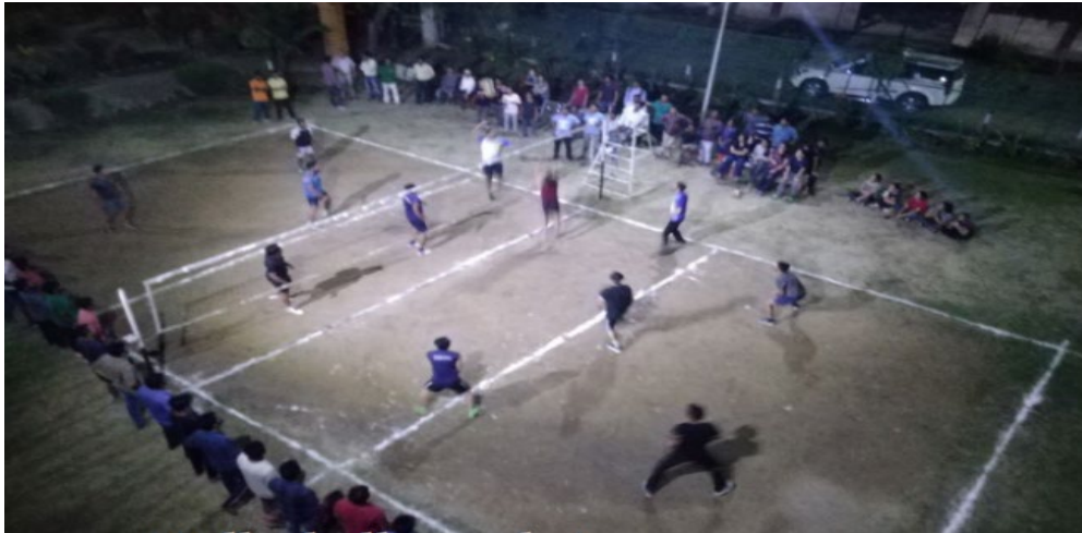
Final volleyball match (Boys) on 16/04/2019