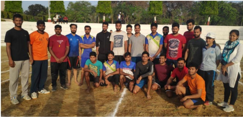
Kabaddi team players before match on 13/4/2019