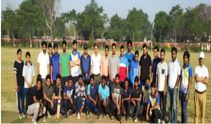
Cricket teams players with IVRI officials on 13/04/2019