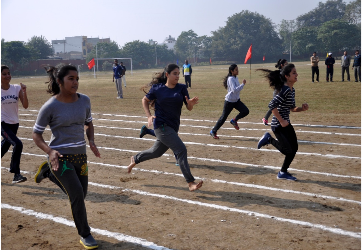
Girl students participating in 100 meter race event on December 7, 2018