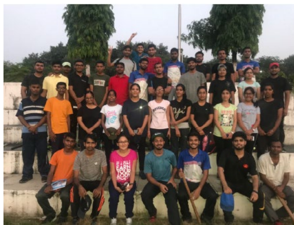
UG student teams with supporters participated in cricket match on September 29, 2018