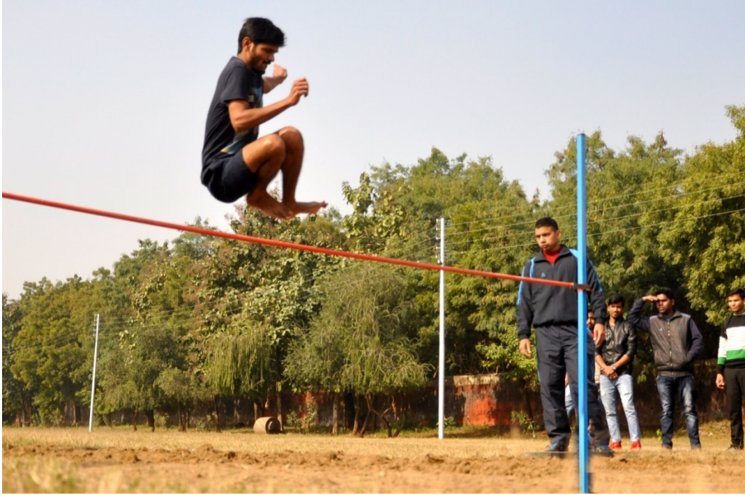
Student taking part in High jump competition (Dated: 8.12.2018)