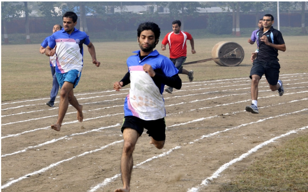
Boy Students participating in 400 meter race event on December 8, 2018