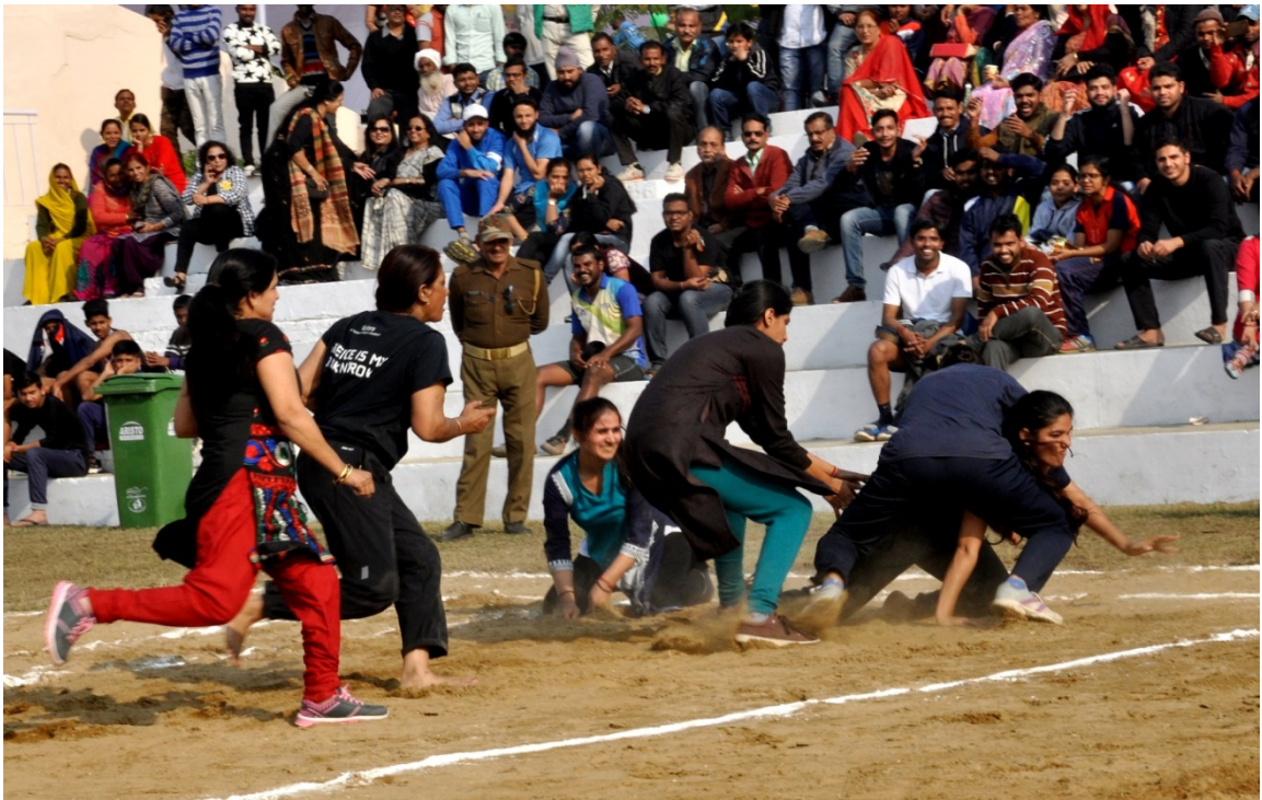
Girls Students participating in Kabaddi match on December 9, 2018