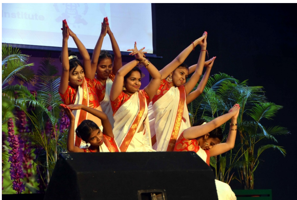
Saraswati Vandana performance by students of ICAR-IVRI (Dated: 25.4.2023)