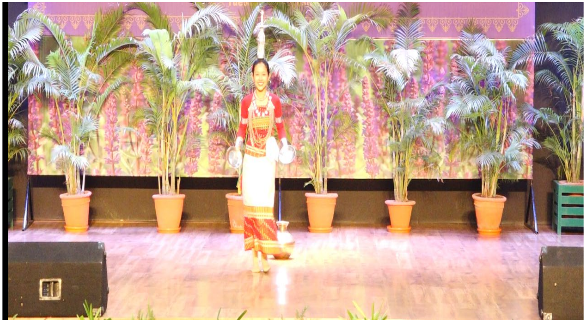
Tripura Folk Dance performance by ICAR-IVRI student (Dated: 25.4.2023)

A diverse array of performances marked the cultural night, showcasing the rich tapestry of Indian culture and the talents of IVRI students. The event commenced with traditional invocations, including a Saraswati Vandana and a Ganesh Vandana , seeking blessings for knowledge and prosperity. This was followed by an enthralling Lavani folk dance , representing the vibrant culture of Maharashtra, and a graceful Tripura folk dance that captivated the audience with its elegance. The evening continued with a variety of other performances, such as a duet dance, a western group dance , several solo dance performances , and a skit , all performed by the talented undergraduate, postgraduate, and PhD students of IVRI.