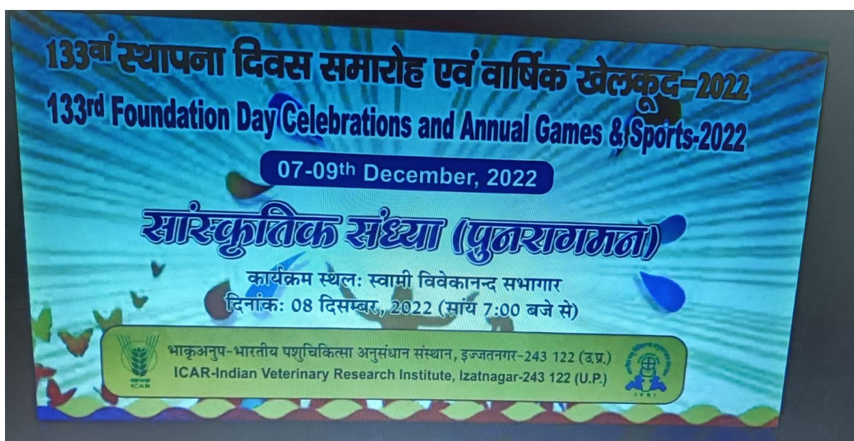
Cultural program at ICAR-IVRI (8.12.2022)

The programme featured a rich and diverse array of performances, each showcasing the unique talents of the students. It began with a reverent Saraswati Vandana , an invocation to the Goddess of Knowledge, setting a spiritual and auspicious tone for the evening. This was followed by a series of captivating folk dances , each representing different cultural traditions of India, which brought vibrancy and colour to the stage. Duet dances and a high-energy western group dance added variety and excitement to the lineup, while solo dance performances allowed individual talents to shine.