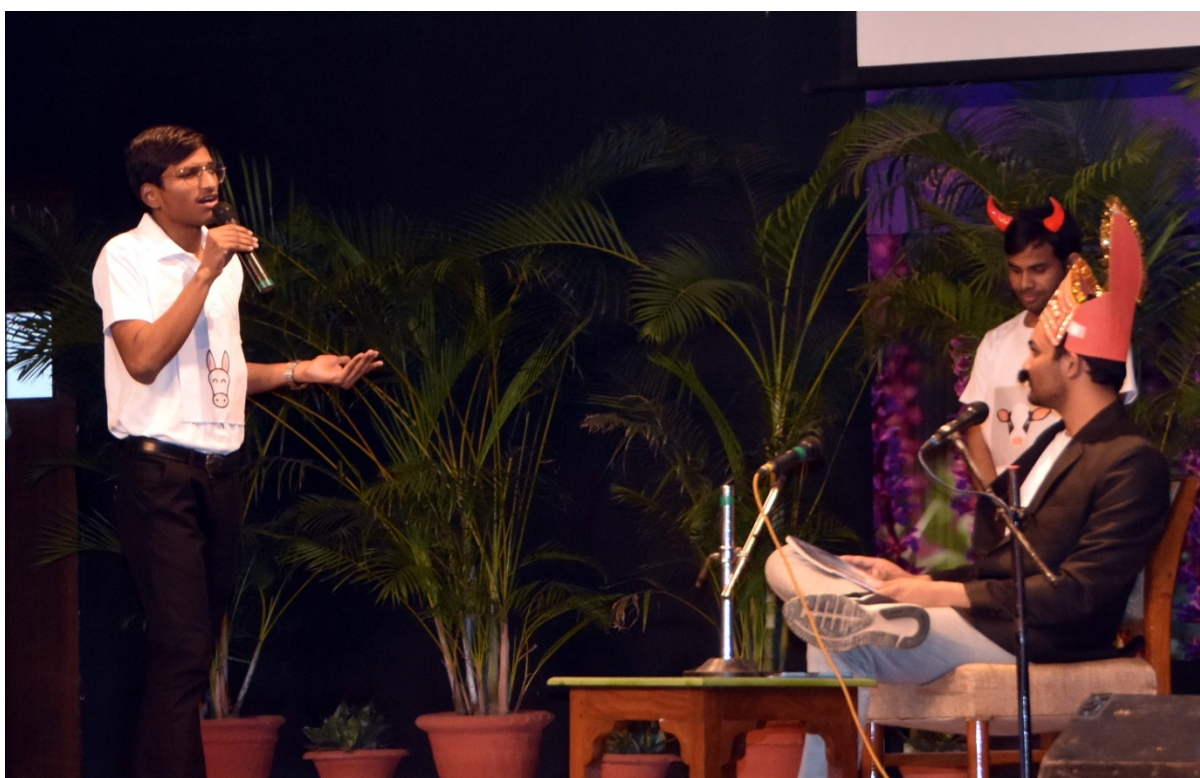
Students performing Skit on 'Prevention of Cruelty to Animals' (Dated: 8.12.2022)