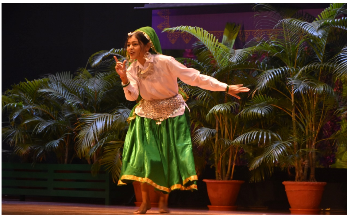
Rajasthani Folk Dance performance by student of ICAR-IVRI (Dated: 8.12.2022)