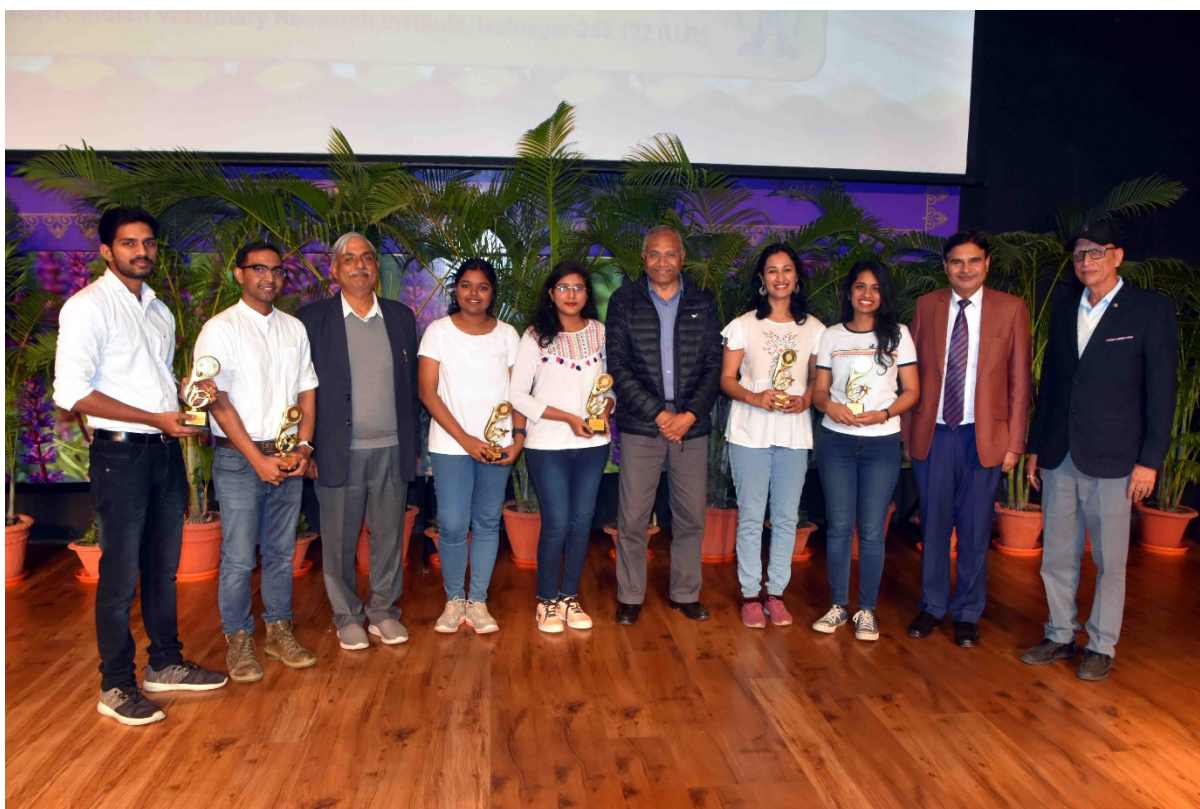
Participants of cultural events with Honourable Director, ICAR-IVRI