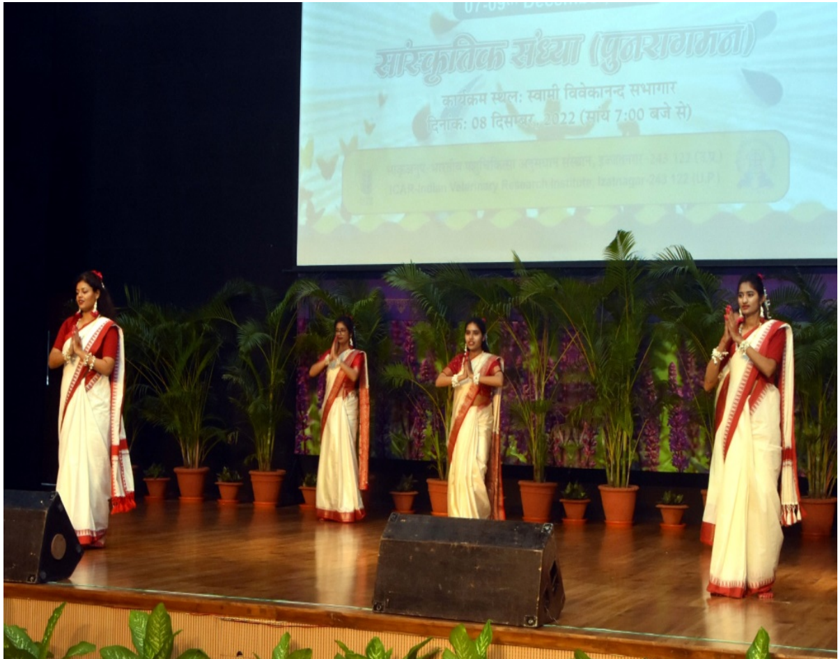
Students performing Saraswati Vandana (Dated: 8.12.2022)

The performances were not limited to a specific group of students; rather, it was a collective effort involving undergraduates, postgraduates, and PhD students of IVRI. This inclusiveness fostered a sense of unity and showcased the diverse talent pool within the institute.