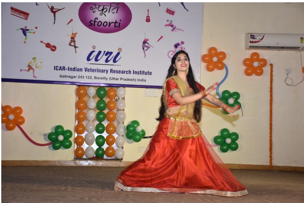
Solo dance by IVRI student (Dated: 10.12.2019)