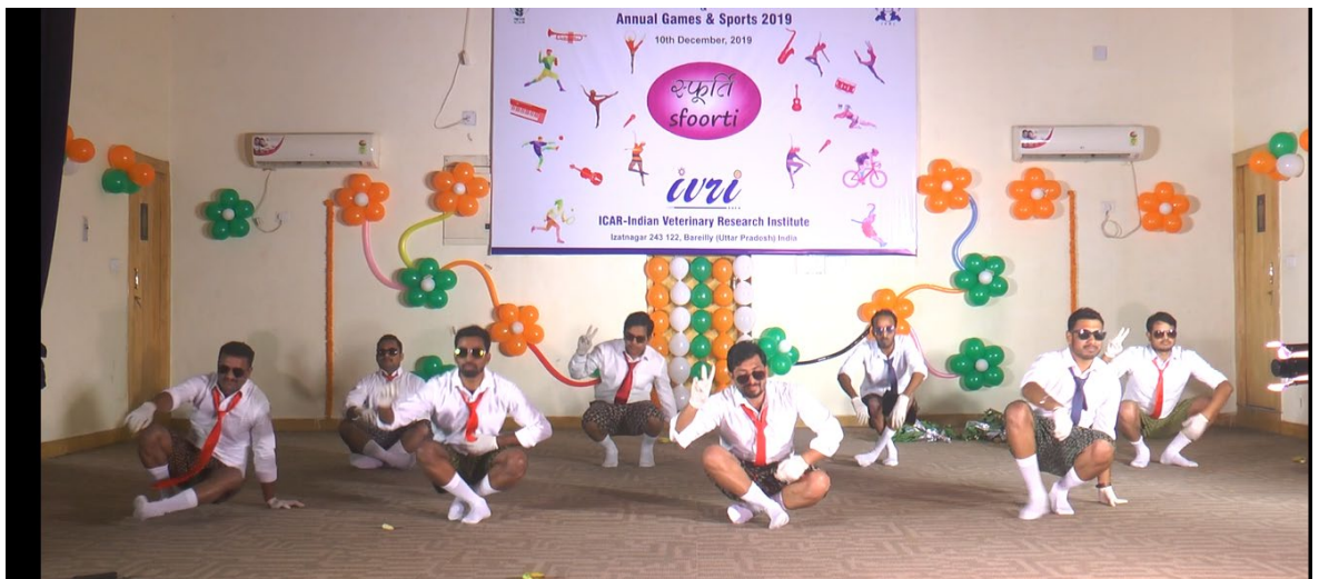
Group dance performed by the students of IVRI (Dated: 10.12.2019)