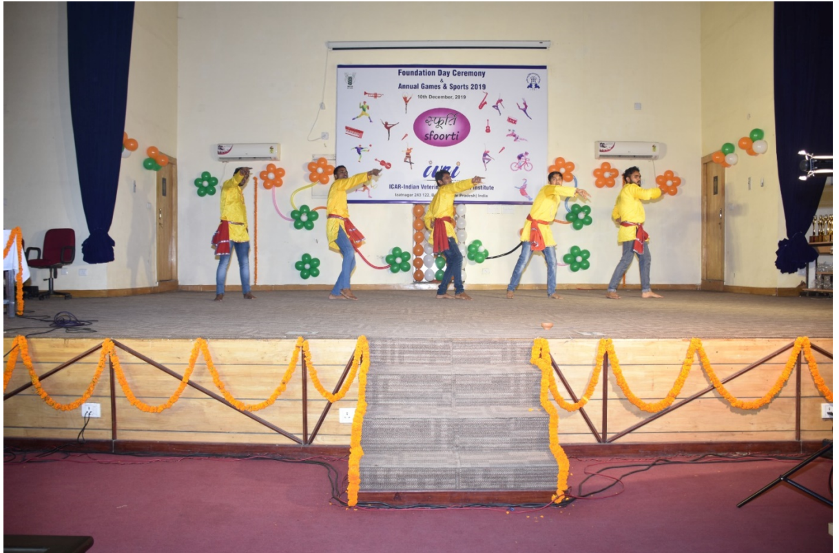
Punjabi folk dance by ICAR-IVRI students (Dated: 10.12.2019)