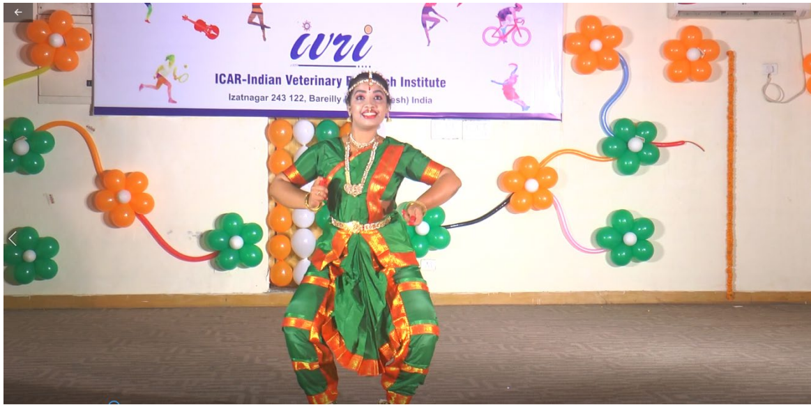
Classical dance by IVRI student showcasing the cultural heritage of India (Dated: 10.12.2019)