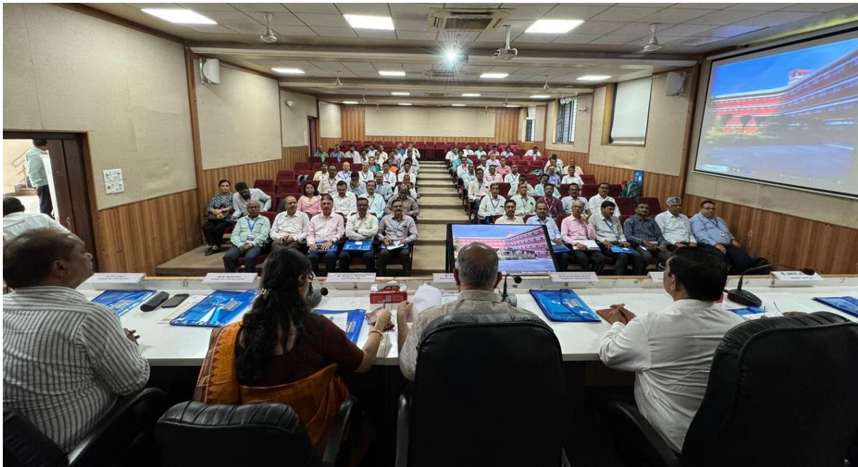
(Glimpse of proceedings of inaugural session of workshop)