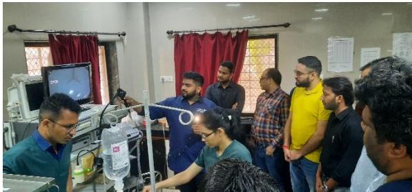
Demonstration of endoscopy