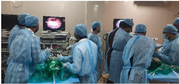
Participating on hands-on training