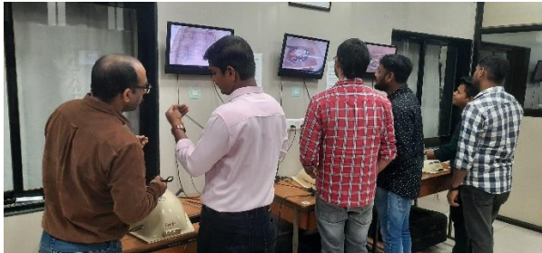
Participants working in dry lab