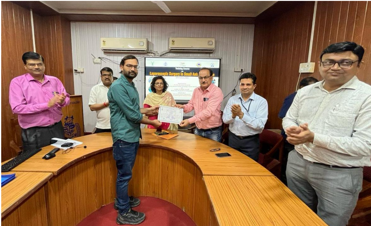
Distribution of certificate to a participant