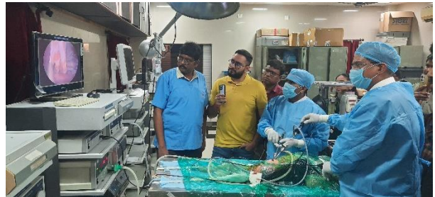
Demonstration of laparoscopy