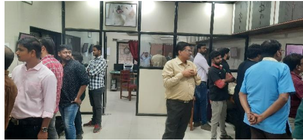
Participants working in dry lab