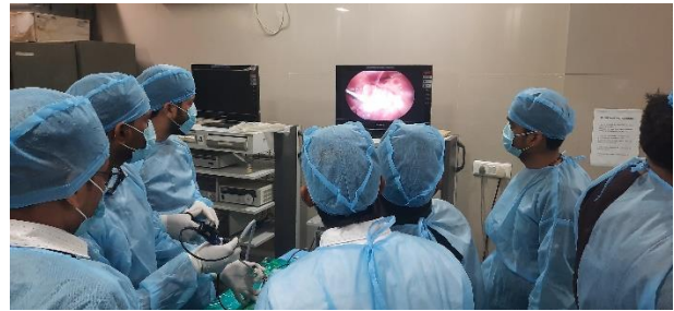
Participating on hands-on training