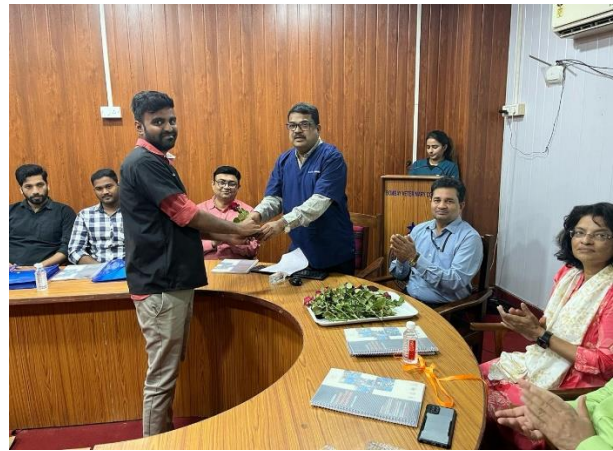
Welcoming of a participant during the inaugural function