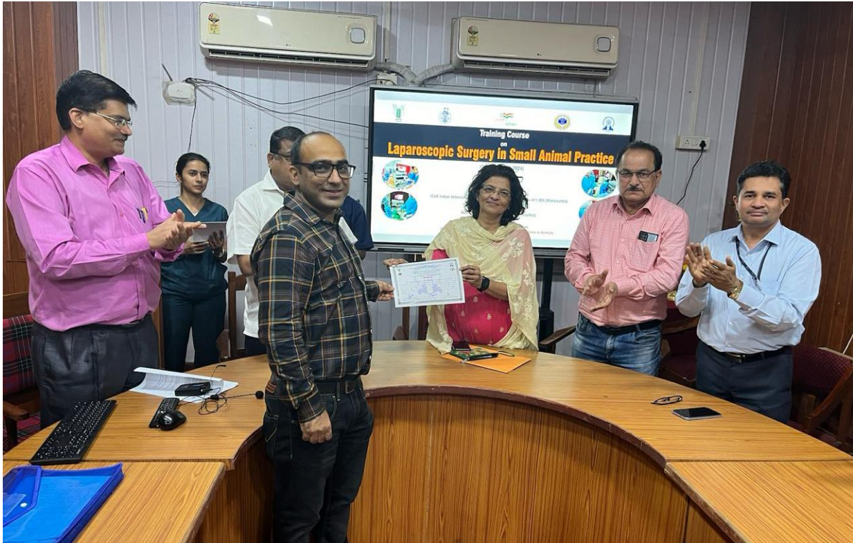
Distribution of certificate to a participant