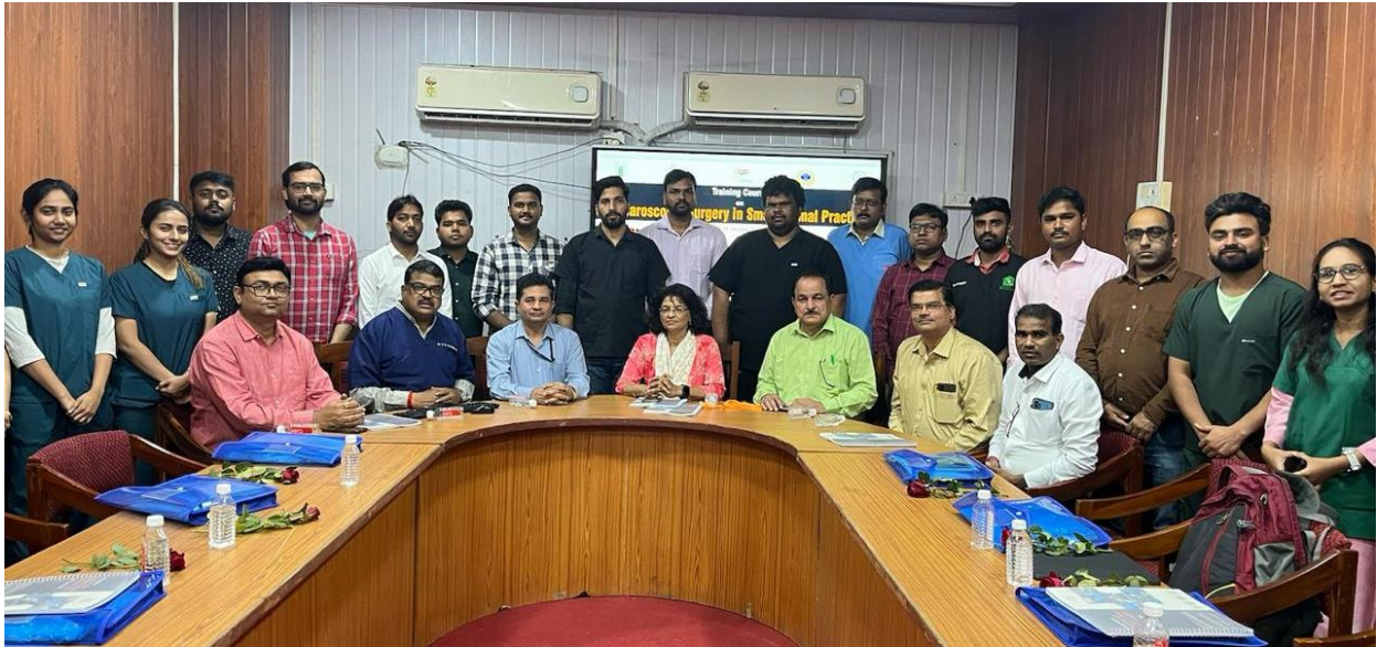
Group photograph of guests and participants after the inaugural function