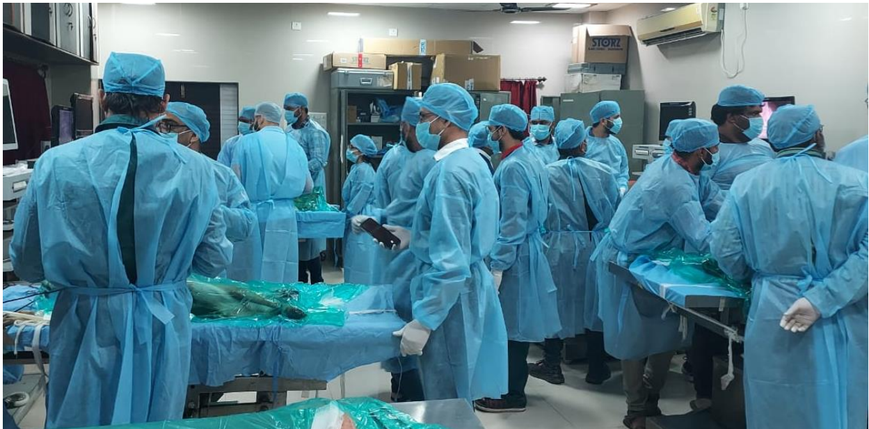
Participants on hands-on training