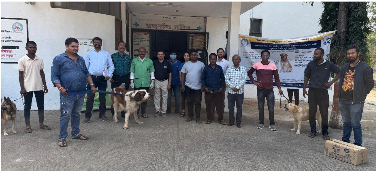
(Glimpse of Orthopedic Animal Health Camp organized by TEC IVRI Pune at Aundh Vet. Polyclinic)

essential diagnostic and treatment services. The camp witnessed enthusiastic participation from 19 local farmers and pet owners, reflecting the trust and credibility TEC Pune has built over the years. Attendees not only received free medical counselling for their animals but also gained valuable insights into the importance of early diagnosis and intervention in orthopedic cases. Veterinarians of AHD and staff of TEC IVRI Pune used the opportunity to educate attendees on the benefits of modern orthopaedic techniques, emphasizing how timely and appropriate treatments can prevent long-term complications, reduce suffering, and enhance productivity in livestock. This knowledge transfer was particularly significant for rural farmers who often face challenges in accessing specialized veterinary services. These cases would be treated during the hands-on practical sessions of training program on “Advanced Techniques of Internal Fixation of Fractures” scheduled during 9-13 December 2024.