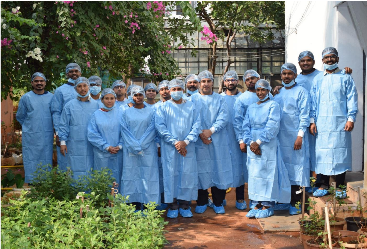
Participants in surgical attire ready for hands-on training