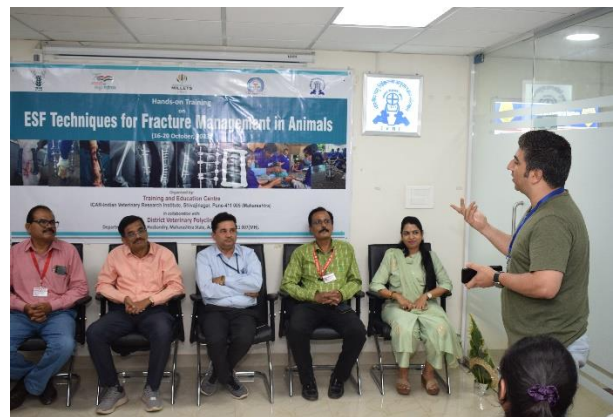
Feedback from one of the participants