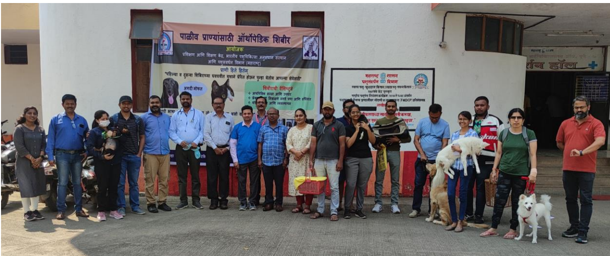
Orthopaedic health camp- team of surgeons with animal owners and patients