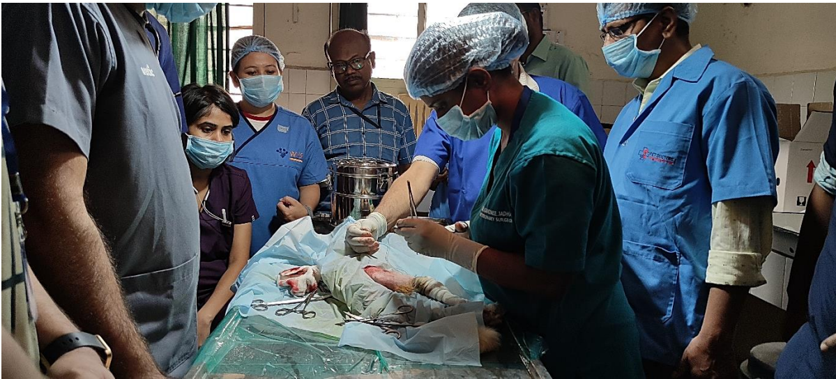
Demonstration and hands-on training on fracture fixation