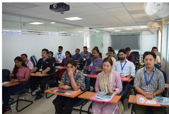
Participants of the training