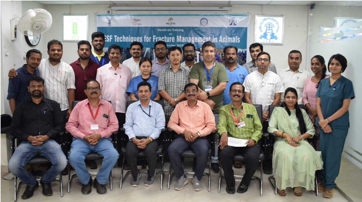
Group photograph with the Chief Guest and participants during the valedictory function