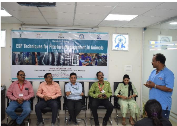
Feedback from one of the participants