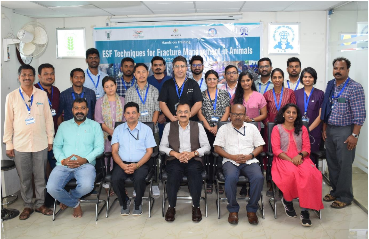
Group photograph of participants, guests and faculty during the inaugural function of training