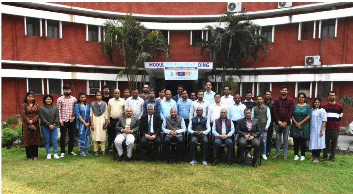
Director, IVRI with organizing team and trainees