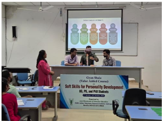
Exercises on Team Work